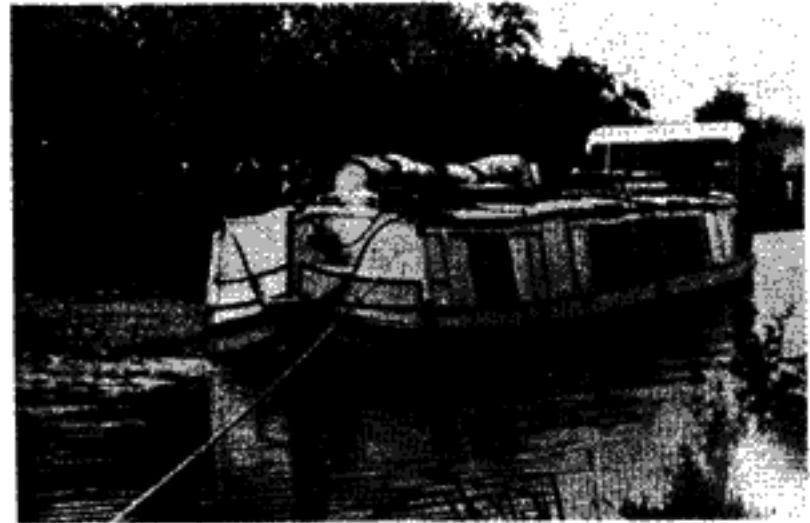
Maumee Valley Historical Society

town University. On September 14, 1789, he was made bishop. With George Washington's aid, Bishop Carroll secured federal funds for Catholic missionaries to the indians of the west. Together with Benjamin Latrobe he planned the Baltimore Cathedral, whose cornerstone was laid in 1806. A staunch patriot, he tirelessly defended religious liberty from the pulpit and in the press.